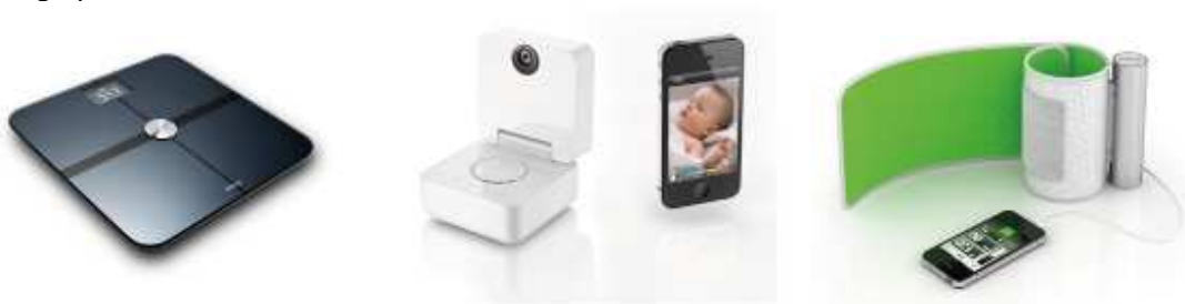
WiFi Body Scale / Smart Baby Monitor Blood / Pressure Monitor