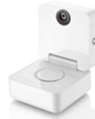
Smart Baby Monitor