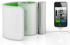
Smart Blood Pressure Monitor